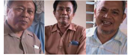
3 Pastors in the Philippines