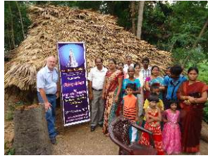
Open new Church